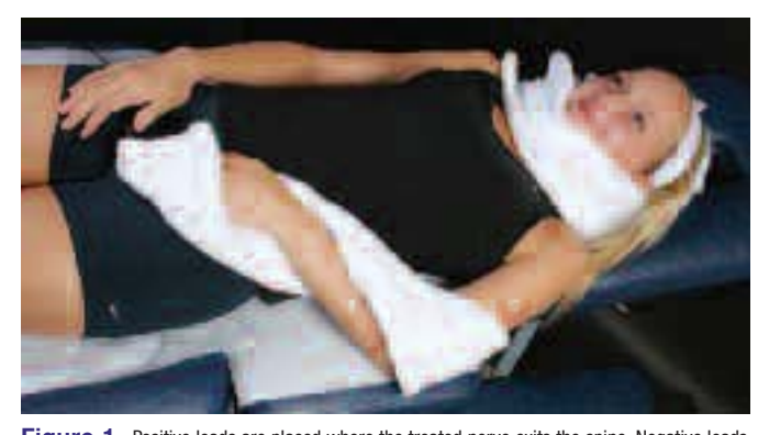
Figure 1. Positive leads are placed where the treated nerve exits the spine. Negative leads are placed at the end of the dermatome. The leads are connected to graphite gloves and the graphite gloves are wrapped in a warm, wet contact to allow coverage and convenient placement. This placement treats the C5-C6-C7-C8 nerve roots.

Patients must be adequately hydrated for the treatment to be effective. In general, patients were instructed to drink 1 to 2 quarts of water in the 3 to 4 hours before treatment. For treatment, the patients were placed in a comfortable, supported position appropriate to the nerve root being treated. The graphite glove electrodes were wrapped in a warm, wet hand towel to allow broad flexible skin coverage and good conductivity (Figure 1). The positive contact was placed at the point on the spine where the nerve exits. The negative contact was placed at the distal end of the nerve to be treated and the current was polarized positive. The frequencies observed to reduce pain were 40Hz on one channel and 396 Hz on the second channel. The pain begins dropping in minutes and declines in a time-dependent fashion over 30 minutes, requiring a maximum of 60 minutes to reach optimal benefit. Treatment beyond 60 minutes did not produce any additional improvement.